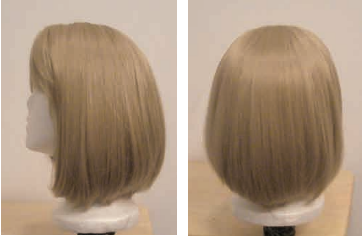
Humble beginnings... Here's what I'm starting with.

As you can see, Link has several lengths of hair. Since Link has those two longer chunks of hair in front, I separated them first and used a hair tie to keep it together and out of the way.